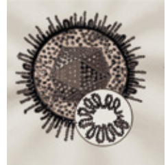
herpes Simplex virus